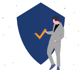
Safe and secure

They firmly believed in investing in their systems and IT infrastructure to deliver modern services and provide streamlined processes for their donors and supporters.